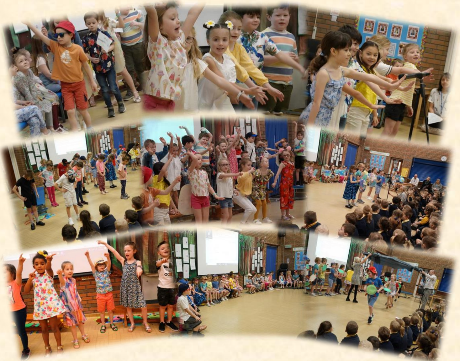
Classes 2 and 3 and our Fulwell family thoroughly enjoyed the children's assemblies.