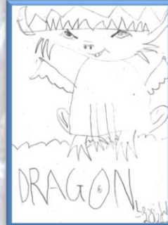
Each Year 1 and 2 class enjoyed a workshop with Liz Million Children worked with Liz as she modelled her drawings for them..