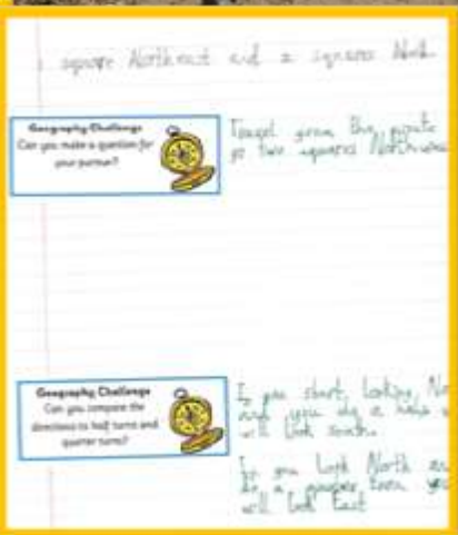
Year 2 children used grid references and co-ordinates for location.