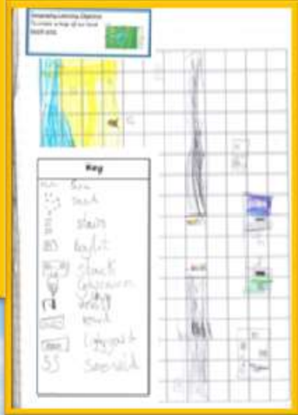
Year 1 children drew an aerial map of the beach for the first time.