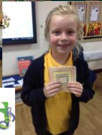
Year 1 and 2 children enjoying Art clubs.